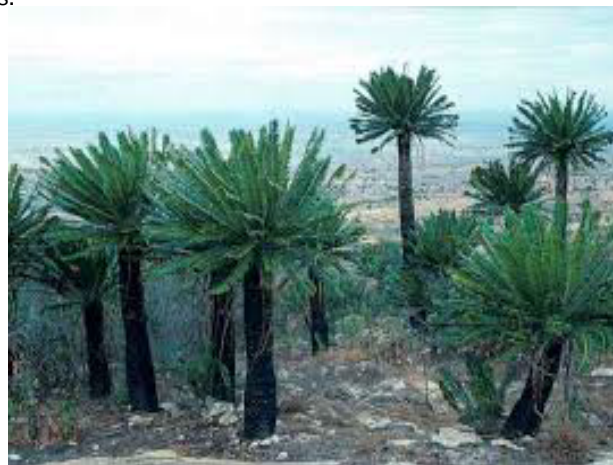
Figure 2. Encephalartos garden (sources cycad pages).