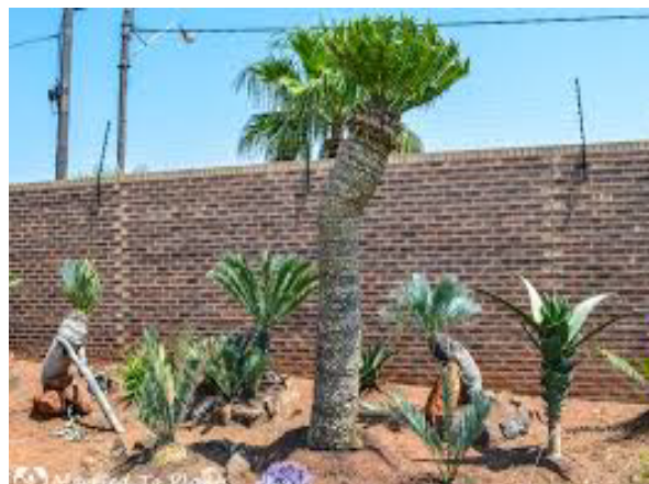
Figure 3. Encephalartos plantation (sources Cycad pages).