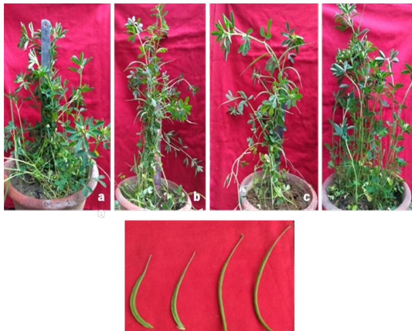
Figure 3. Plant height and growth habit variants in treated M_1 generation of fenugreek varieties. a: Plants with dwarf growth habit. b: Plants with tall growth habit. c: Plants with more branching and long internodes. d: Plants with normal growth habit. e: Variations in pod size.