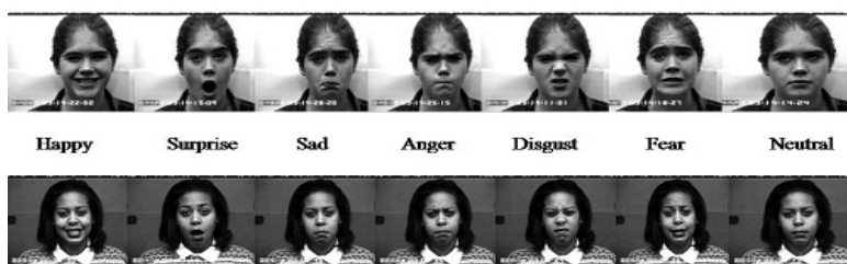
Fig. 5. Cohn Kanade facial expressions

The proposed algorithm has been tested on Cohn-Kanade database [36]. This database includes 388 image sequences from 100 subjects. Each sequence contains 12-16 frames. The subject's age ranges from 18 to 30 years. Sixty-five percent of subjects were female and thirty-five percent were male. Fifteen percent of subject comes from the Africa-American background and three percentage from the Latin-American and Asian based subjects. The image sequences represented 100 different subjects expressing different stages of expression development, starting from a low arousal stage, reaching a peak of arousal and then declining. Facial expressions of each subject represent seven basic expression include anger, disgust, fear, happy, surprise, sad. The seven facial expressions from this database are shown in Fig. 5.