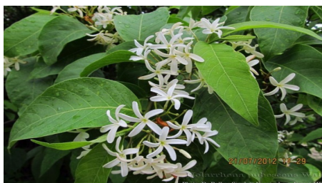
Figure 6. Holarrhena antidysenterica (L.) Wall ex Decne.

Voucher number: MA 16; 04.05.2014; Rajshahi ( Figure 6 ).