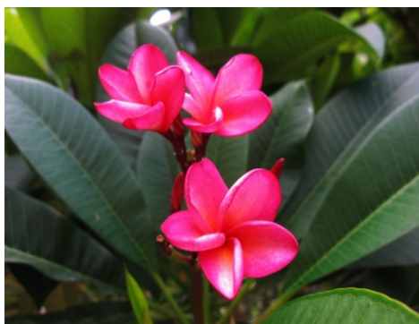
Figure 10. Plumeria rubra L.

Voucher number: MA 20; 04.09.2013; Rajshahi University ( Figure 10 ).