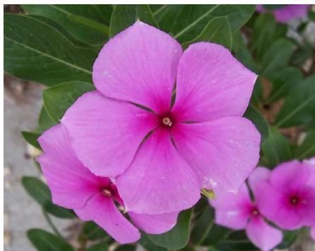
Figure 4. Catharanthus roseus (L.) G. Don.

Voucher number: MA 14; 09.04.2014; Rajshahi University Campus ( Figure 4 ).