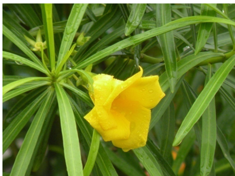
Figure 14. Thevetia peruviana (Pers) K. Schum.

Voucher Number: MA 24; 04.08.2013; Rajshahi University Campus ( Figure 14 ).