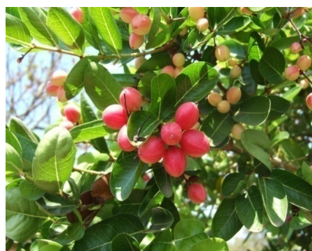
Figure 3. Carissa carandas L.

Voucher number: M.A 13; 02.03.2014; Rajshahi ( Figure 3 ).