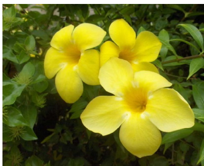
Figure 1. Allamanda cathartica L.

Voucher number: MA 10; 02.01.2014; Rajshahi University Campus ( Figure 1 ).