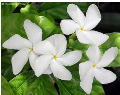
Figure 13. Tabernaemontana divaricata (L.) R. Br ex Roem.

Voucher Number: MA 23; 04.10.2013; Rajshahi University Campus ( Figure 13 ).