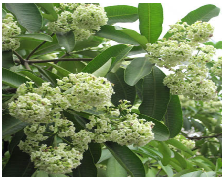
Figure 2. Alstonia scholaris (L.) R. Br.

Voucher number: MA 11; 02.11.2013; Katakhai ( Figure 2 ).