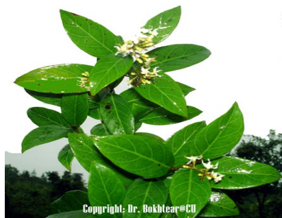
Figure 7. Ichnocarpus frutescens (L.) R. Br.

Voucher number: MA 17; 04.04.2014; Rajshahi University Boanical Garden ( Figure 7 ).