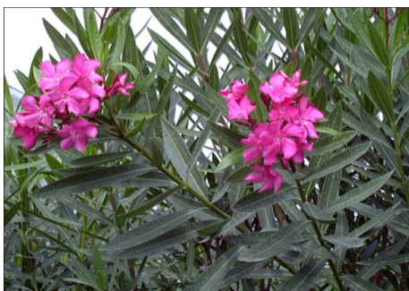
Figure 8. Nerium oleander Linn.

Voucher number: MA 18; 04.06.2014; North site of Rajshahi University Stadium ( Figure 8 ).