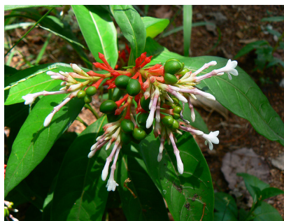
Figure 11. Rauvolfia serpentina (L.) Benth ex Kurz.

Voucher Number: MA 21; 04.11.2013; Rajshahi University Campus ( Figure 11 ).