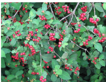
Figure 12. Rauvolfia tetraphylla L.

Voucher number: MA 22; 04.12.2013; Rajshahi ( Figure 12 ).