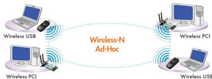
Fig 1. Wireless Adhoc Network

The network must allow any two nodes to communicate by relaying the information via other nodes. A “path” is a series of links that connects two nodes. Various routing methods use one or two paths between any two nodes; flooding methods use all or most of the available paths.