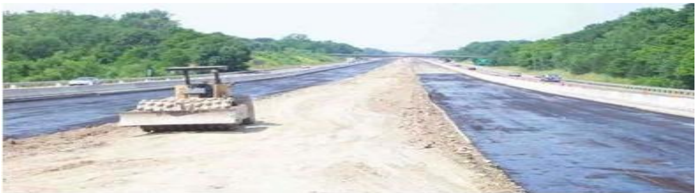
Fig. 7 Prime coat emulsion for curing