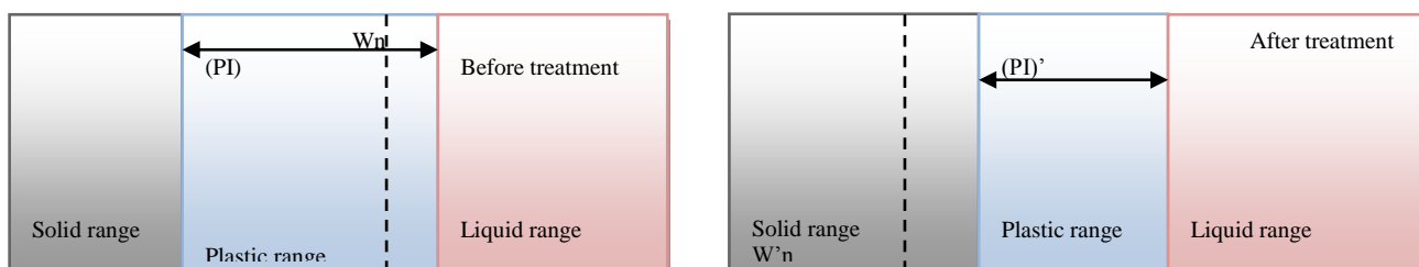
Fig.1. Effect of liming on the consistency of soil