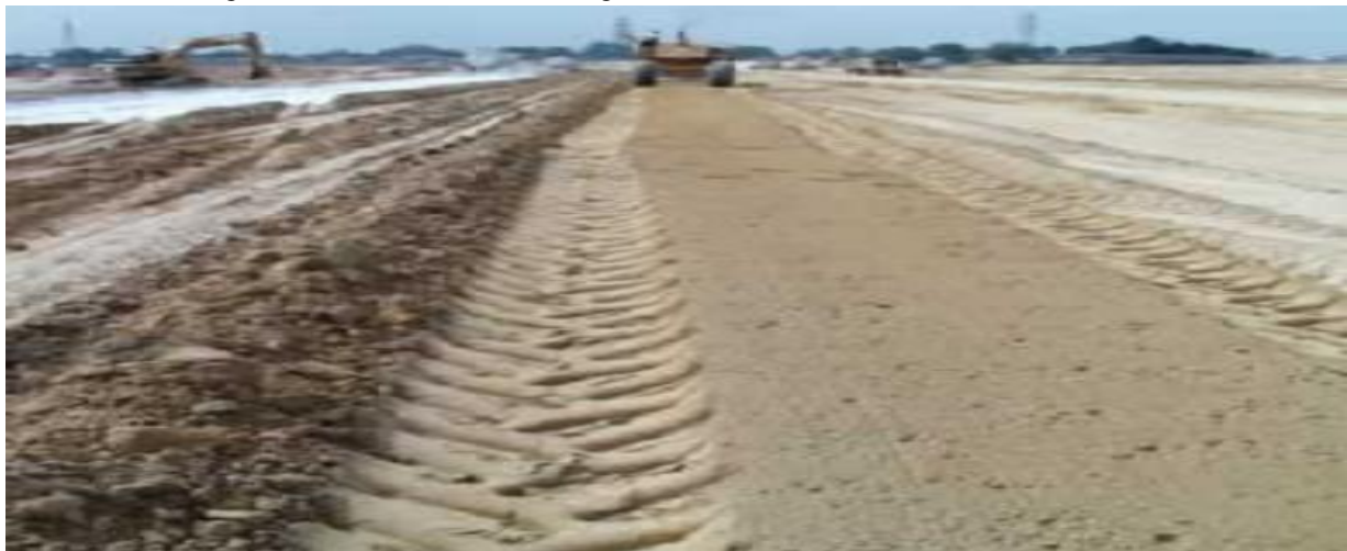
Fig. 5 Mixing and pulverization

D. Final mixing and pulverization: To accomplish complete stabilization, adequate final pulverization of the clay fraction and thorough distribution of the lime throughout the soil are essential.