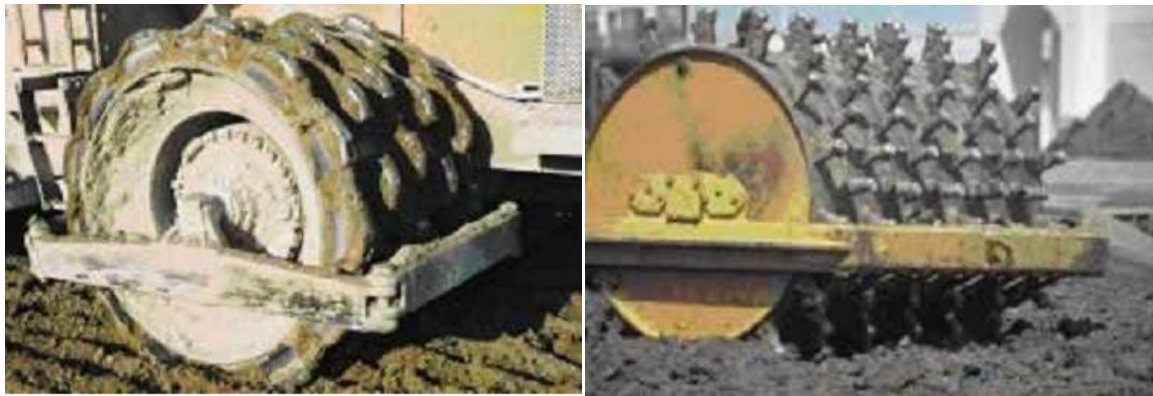
Fig.6 Sheepsfoot (above) & padfoot (below) rollers