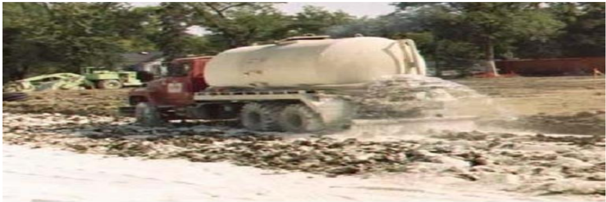
Fig.4 Adding water after dry lime application

D. Final mixing and pulverization: To accomplish complete stabilization, adequate final pulverization of the clay fraction and thorough distribution of the lime throughout the soil are essential.