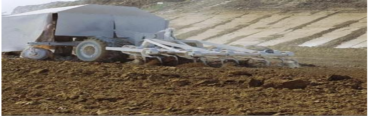
Fig. 2 Scarification before lime application