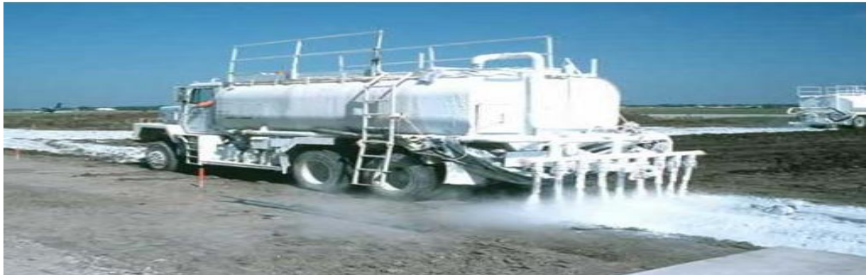
Fig. 3 Spreading of lime over scarified soil