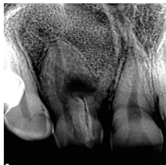
Figure 1B. Periapical radiographic examination.

A CBCT scan was performed with an I-CAT apparatus (Kavo-Kerr, Joinville-SC, Brazil). The images revealed a periapical radiolucency which was larger than that observed radiographically ( Figure 2 ). The diagnosis of Oehlers type 2 DI with pulp necrosis and a chronic apical abscess was established for the maxillary right lateral incisor.