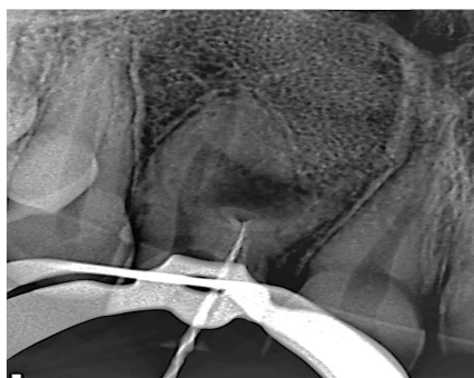
Figure 3B. Intraoperative radiographs depicting cleaning and shaping procedures with Waveone primary instrument.