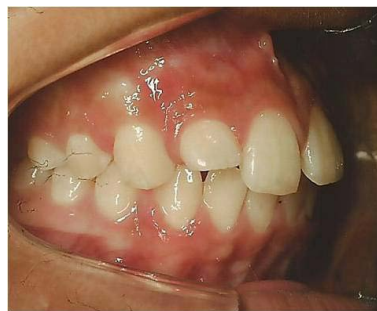
Figure 1A. Intraoral clinical examination.

Radiographic evaluation revealed an invagination into the pulp chamber of the tooth, and there was periapical radiolucency. Two canals were visualized: the main canal located distally, which tapered progressively toward the apex, and an invaginated canal located mesially and separate from the main root canal ( Figure 1B ).