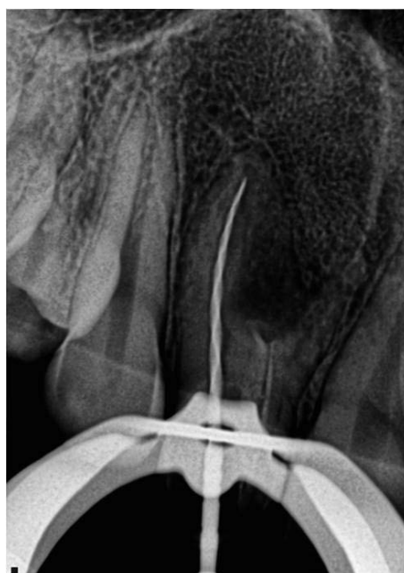
Figure 3A. Intraoperative radiographs depicting cleaning and shaping procedures with Waveone large instrument.

The access openings were temporized with Cavit (3M ESPE, St. Paul, MN-USA). The patient was referred to her general practitioner for permanent restoration. After one year, the patient returned asymptomatic, the tooth was functional and had no sensitivity to percussion or palpation. The radiographic assessment of the tooth showed significant osseous healing of the preoperative lesion ( Figure 3C ).