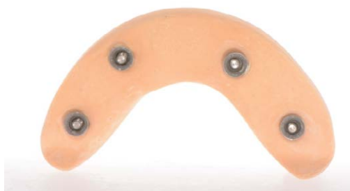
Figure 4: Finalized index made with stone, ready to be tried in the mouth