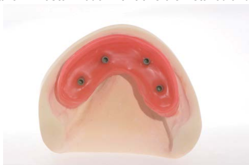
Figure 2: Master cast with a wall made of wax