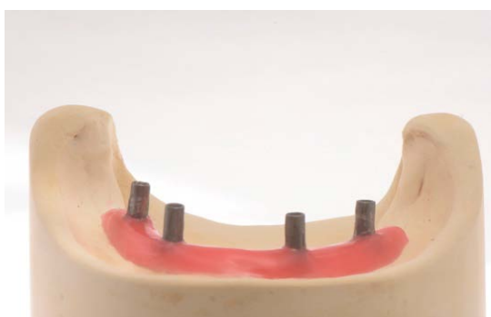
Figure 1: Master model with transfers installed and wax.

The success of treatments that include a rigid connection between implants depends on a correct transfer of the position of the implants, with the use of appropriate impression techniques and the verification of the positioning of the implants with a rigid reference. This increases the predictability of the treatment and decreases the need for repetitions and corrections.