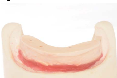
Figure 3: Index made with stone, with transfers in position