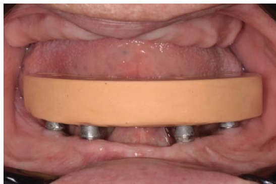
Figure 5: Adapted stone index in the mouth.