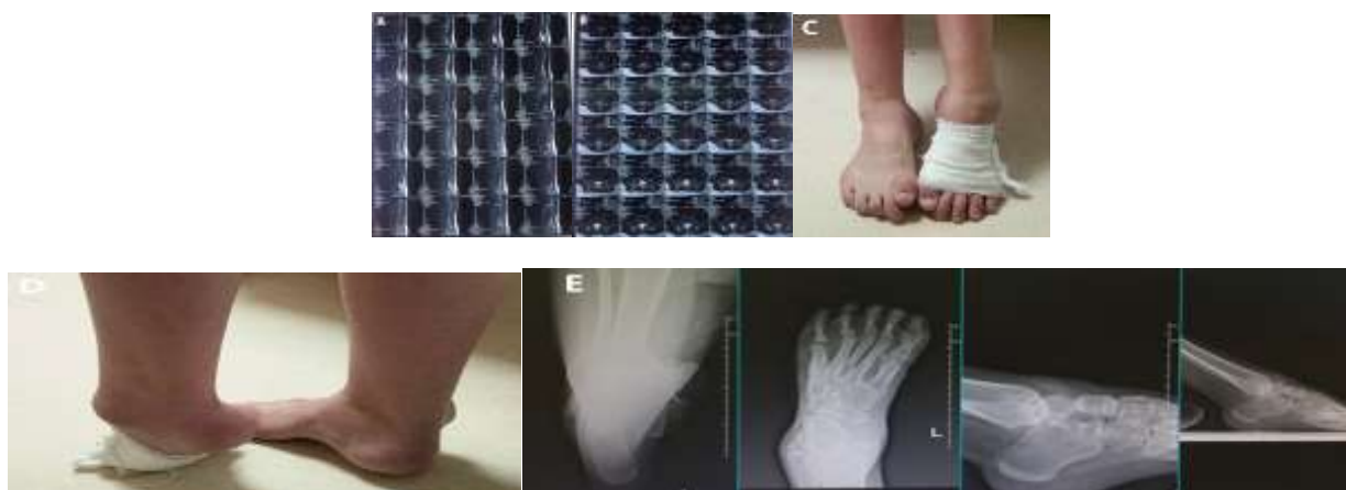
Figure 2. Lumbar MRI reexamination after spinal cord related surgery showed : (A and B) left fat mass was found in the spinal cord; (C and D) X ray of both feet showed: left and right heel pronation, left food plantar flexion; (E) Heel pronation in the left heel loading long axis position; Weight bearing position of left ankle showed plantar flexion of ankle, plantar flexion of first metatarsal; (F) Persistent plantar ulcers.

He underwent spinal cord surgery at that time. Six years after the operation, the left foot varus was significantly worsened, the left ankle flexion and extension was limited, the ankle joint plantar flexion was 70°, and the average range of motion was 10° (plantar flexion 10°-back extension 0°); tibialis anterior muscle and fibulamuscle strength level 0, tibialis posterior muscle strength level 2, Raise the medial longitudinal arch, plantar ulceration, sphincter bladder function paralysis, and catheterization bag for 5 years (Figure 2).