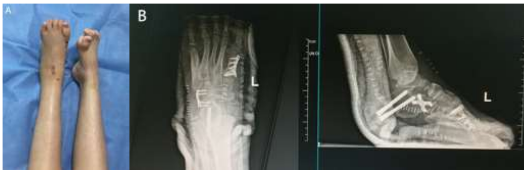
Figure 4. Postoperative results showed that: (A) the left foot Equinovarus deformity was corrected with A beautiful appearance, and the right foot deformity was not operated on; (B) Postoperative X-ray examination.

On the 35 th day after the operation, patient is required to walk with two crutches or Help line device without weight. 60 days after surgery, partial weight-bearing walking exercise was started. After 90 days of surgery, walk with full weight and resume daily life (Figure 5).