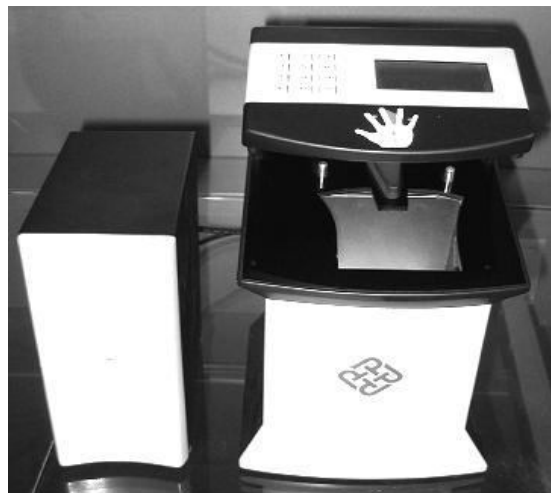
Figure 2: A CCD-based palmprint scanner

To capture palmprint image, various types of scanner devices are used. Few of the examples are CCD-based scanners, digital scanners, video camera and tripod to collect palmprint images. A CCD-based scanner captures high resolution images and aligns palms accurately whereas, digital scanners produces low quality image and requires large time for scanning. Figure 2 shows one of the palmprint image from Hong Kong Polytechnic University captured using CCD. Digital scanners are cost-effective to collect palmprint images. However, they cannot support real-time verification because of the scanning time. Digital cameras and video cameras are two ways to collect contactless palmprint images. Digital scanners are not suitable for real-time applications because of the scanning time. Also the quality of digital camera is low because they collect is in an uncontrolled environment with illumination variations and distortions due to hand movement.