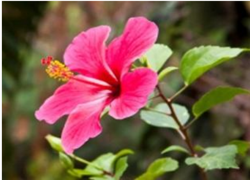
Fig. 1. Flower of Hibiscus rosa sinensis

After detection of text, how text region is filled using an Inpainting technique that is given in Section III. Section IV presents experimental results showing results of images tested. Finally, Section V presents conclusion.