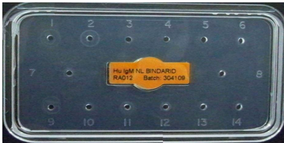
Figure 2b. Single radial immunodiffusion analysis of IgM in human colostrum and milk during the first week postpartum. Wells No: 1, 2, 3, 4, 5, 6, 7 and 8 represent samples of mother number 3 at 0-0.5, 1, 2, 3, 4, 5, 6 and 7 days postpartum, respectively. Wells No: 9, 10, 11, 12, 13 and 14 represent samples of mother number 4 at 0-0.5, 1, 2, 3, 4 and 5 days postpartum, respectively.