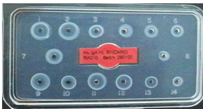
Figure 1b. Single radial immunodiffusion analysis of IgA in human colostrum and milk during the first week postpartum. Wells No: 1, 2, 3, 4, 5, 6, 7 and 8 represent samples of mother number 3 at 0-0.5, 1, 2, 3, 4, 5, 6 and 7 days postpartum, respectively. Wells No: 9, 10, 11, 12, 13 and 14 represent samples of mother number 4 at 0-0.5, 1, 2, 3, 4 and 5 days postpartum, respectively.