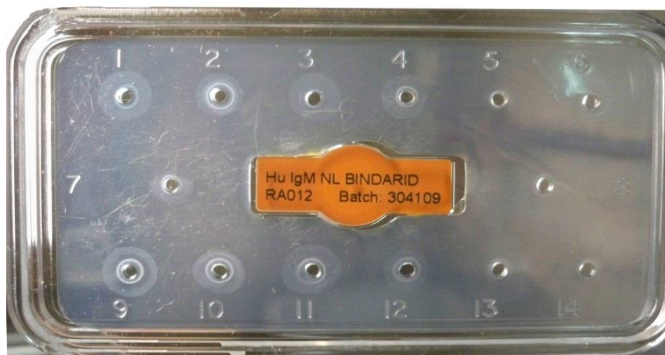
Figure 2c. Single radial immunodiffusion analysis of IgM in human colostrum and milk during the first week postpartum. Wells No: 1, 2, 3, 4, 5, 6, 7 and 8 represent samples of mother number 5 at 0-0.5, 1, 2, 3, 4, 5, 6 and 7 days postpartum, respectively. Wells No: 9, 10, 11, 12, 13 and 14 represent samples of mother number 6 at 0-0.5, 1, 2, 3, 4 and 5 days postpartum, respectively.

Finally, IgG contents were significantly higher during 0-0.5 day than those of other day's parturition, being 0.88 \pm 0.42 g/L, then it dropped to 0.53 \pm 0.21 and 0.37 \pm 0.15 g/L at 1 st and 2 nd days postpartum in the same order. Also, a gradually decrease could be noticed on the following days, being 0.29 \pm 0.13 , 0.25 \pm 0.14 , 0.22 \pm 0.12 , 0.17 \pm 0.08 and 0.13 \pm 0.07 g/L at 3, 4, 5, 6 and 7 days postpartum, respectively ( Table 1 and Figures 3a-3c ). In our study, IgG contents were higher than those of [23] being at 1 st (43 mg/100 ml) and 4 th (4 mg/100 ml) days of lactation. In contrast it was lower than that of [24] who found that the IgG contents were 0.53, 0.19 and 0.03 g/L at 0,3 and 6 days postpartum, respectively. Additionally, they established that a gradually decrease in the IgG content within the first few hours parturition and the following days after delivery. IgG level was 0.063 mg/ml in colostrum of Mayan India women (1-4 days postpartum) [34]. While IgG content in human colostrum was 10 mg/100 ml [35].