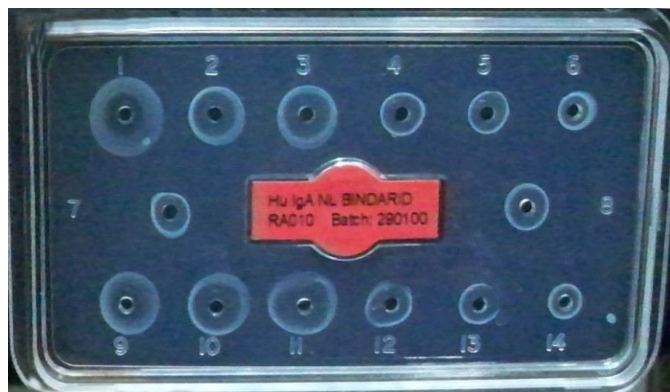
Figure 1a. Single radial immunodiffusion analysis of IgA in human colostrum and milk during the first week postpartum. Wells No: 1,2,3,4,5,6 and 7 represent samples of mother number 1 at 0-0.5, 1, 2, 3, 4, 5 and 6 days postpartum, respectively. Wells No: 9, 10, 11, 12, 13, 14 and 8 represent samples of mother number 2 at 0-0.5, 1, 2, 3, 4, 5 and 6 days postpartum, respectively.