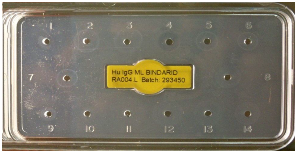
Figure 3a. Single radial immunodiffusion analysis of IgG in human colostrum and milk during the first week postpartum. Wells No: 1, 2, 3, 4, 5, 6 and 7 represent samples of mother number 1 at 0-0.5, 1, 2, 3, 4, 5 and 6 days postpartum, respectively. Wells No: 9, 10, 11, 12, 13, 14 and 8 represent samples of mother number 2 at 0-0.5, 1, 2, 3, 4, 5 and 6 days postpartum, respectively.