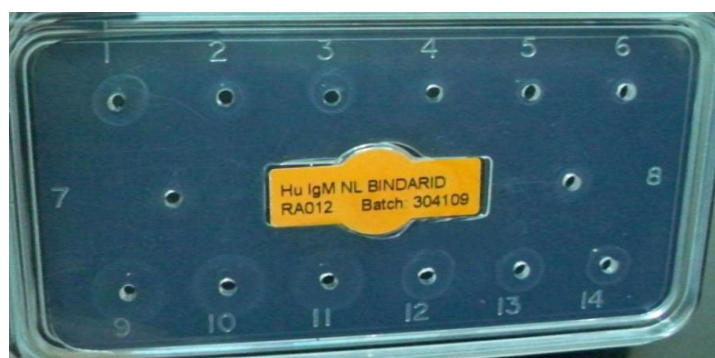
Figure 2a. Single radial immunodiffusion analysis of IgM in human colostrum and milk during the first week postpartum. Wells No: 1, 2, 3, 4, 5, 6 and 7 represent samples of mother number 1 at 0-0.5, 1, 2, 3, 4, 5 and 6 days postpartum, respectively. Wells No: 9, 10, 11, 12, 13, 14 and 8 represent samples of mother number 2 at 0-0.5, 1, 2, 3, 4, 5 and 6 days postpartum, respectively.