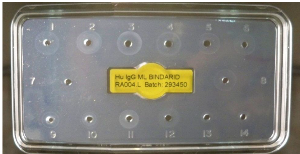
Figure 3b. Single radial immunodiffusion analysis of IgG in human colostrum and milk during the first week postpartum. Wells No: 1, 2, 3, 4, 5, 6, 7 and 8 represent samples of mother number 3 at 0-0.5, 1, 2, 3, 4, 5, 6 and 7 days postpartum, respectively. Wells No: 9, 10, 11, 12, 13 and 14 represent samples of mother number 4 at 0-0.5, 1, 2, 3, 4 and 5 days postpartum, respectively.