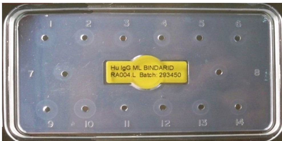
Figure 3c. Single radial immunodiffusion analysis of IgG in human colostrum and milk during the first week postpartum. Wells No: 1, 2, 3, 4, 5, 6, 7 and 8 represent samples of mother number 5 at 0-0.5, 1, 2, 3, 4, 5, 6 and 7 days postpartum, respectively. Wells No: 9, 10, 11, 12, 13 and 14 represent samples of mother number 6 at 0-0.5, 1, 2, 3, 4 and 5 days postpartum, respectively.