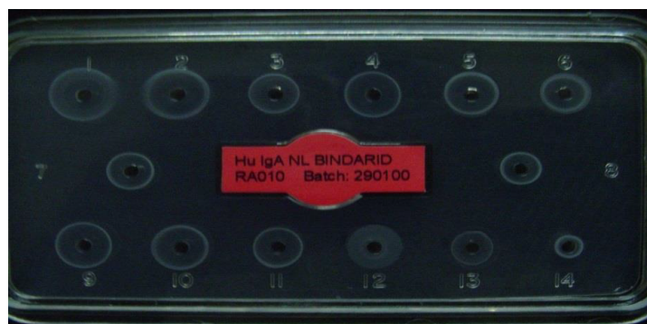
Figure 1c. Single radial immunodiffusion analysis of IgA in human colostrum and milk during the first week postpartum. Wells No: 1, 2, 3, 4, 5, 6, 7 and 8 represent samples of mother number 5 at 0-0.5, 1, 2, 3, 4, 5, 6 and 7 days postpartum, respectively. Wells No: 9, 10, 11, 12, 13 and 14 represent samples of mother number 6 at 0-0.5, 1, 2, 3, 4 and 5 days postpartum, respectively.