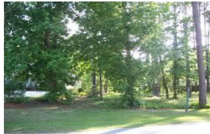
Figure.4 Atmospheric blur image

where variance \sigma_G determines the severity of the blur, and constant C is chosen so that the sum of the coefficients is equal to one (Lagendijk & Biemond 2005). Figure illustrates a discrete atmospheric turbulence blur PSF h(n) corresponding to \sigma_G = 9/4 and Figure shows the corresponding magnitude response |H(u)| . In the continuous case, the magnitude response would be a pure 2-D Gaussian, but in the discrete case, it contains some oscillation due to the finite support of the PSF. Figure illustrates an image which is Gaussian blurred using the PSF in Figure . Figure shows an arbitrary blur PSF, the magnitude response being shown in Figure. The corresponding blurred image is illustrated in Figure . The existing blur invariant image features are based on the assumption that the PSF of the blur is spatially invariant and centrally symmetric with respect to the origin . These conditions are met by the above mentioned forms of motion, out of focus, and atmospheric turbulence blur PSFs.