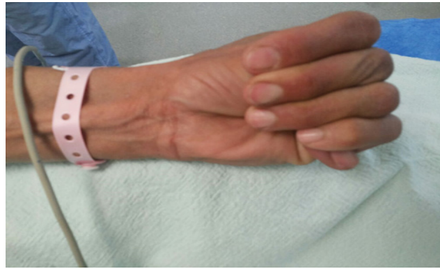
Figure 1. Tall, thin with steinberg sign.

At the fourth day of the 36 th week of gestation, she suffered from chest pain referred to the back, so her treating physician performed CT with contrast for chest, abdomen and pelvis which showed dissecting flap extending from the ascending aorta involving the arch, descending aorta in the chest and the abdomen till the bifurcation with false and true lumen, but the aortic branches arising from the true lumen with average perfusion for different organs ( Figure 2 ).