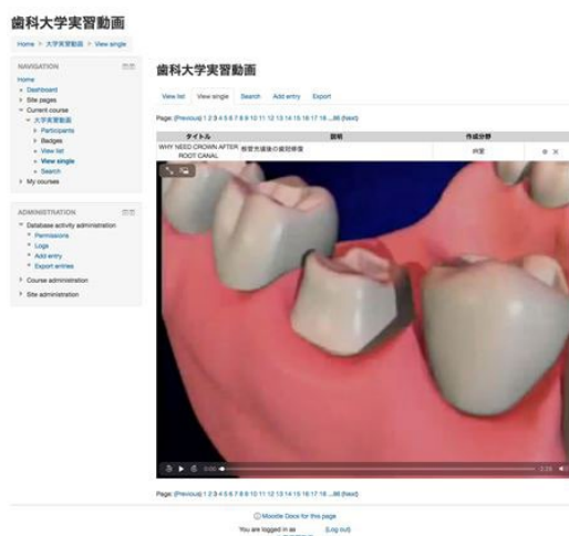
Figure 4. Viewing videos screen.