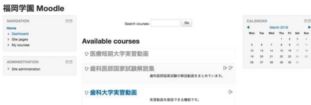
Figure 2. Course select screen.