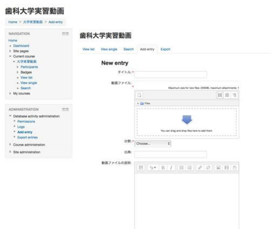
Figure 5. Upload of a video screen.