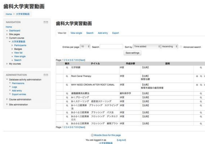
Figure 3. Contents select screen.