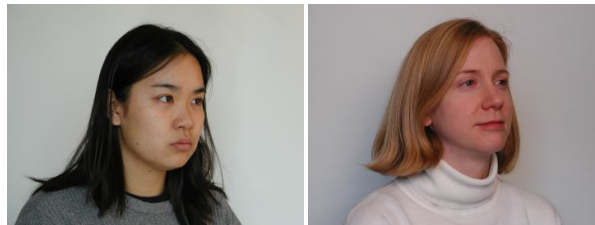
Fig 1. Input images

The keypoints [4] and feature based on scale invariant feature transform(SIFT) are used to account for illumination changes in the detection of copy-move region duplication. The robustness of SIFT keypoints and features to image distortions is not fully exploited, which prevents this method from being extended to detect affine transformed duplicated regions. Image content is transformed into local feature coordinates that are invariant to translation, rotation, scale and other imaging parameter.