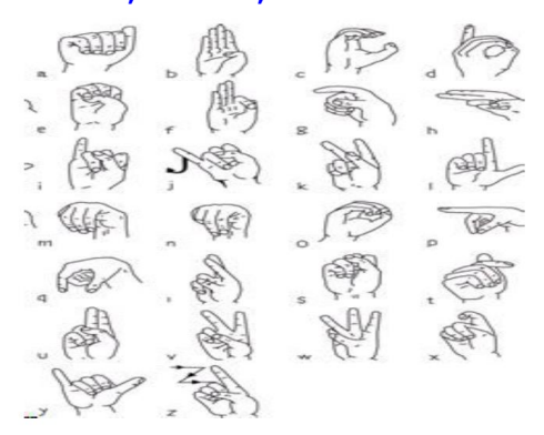
Figure 1: ASL gestures.

(An ISO 3297: 2007 Certified Organization) Vol. 5, Issue 6, June 2017