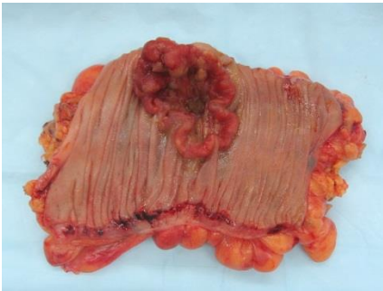
Figure 1: Colon cancer.

controlled by imaging, by surgical investigation, and/or by a pathologist after examination of the tissue from a biopsy or a surgical example [80-100].