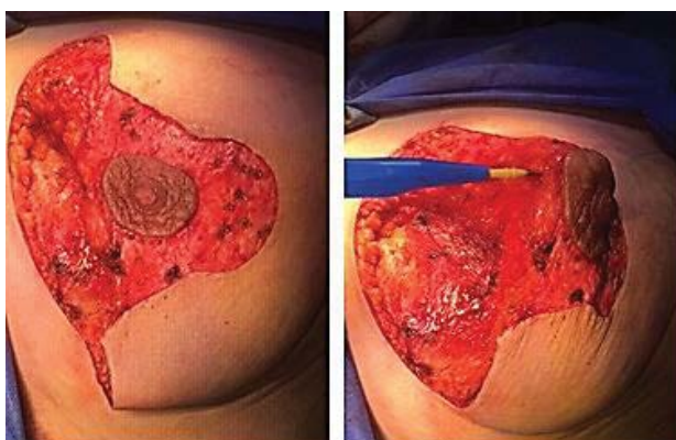
Figure 3. Left breast after quadrantectomy, de-epithelialization zone and post-resection defect.