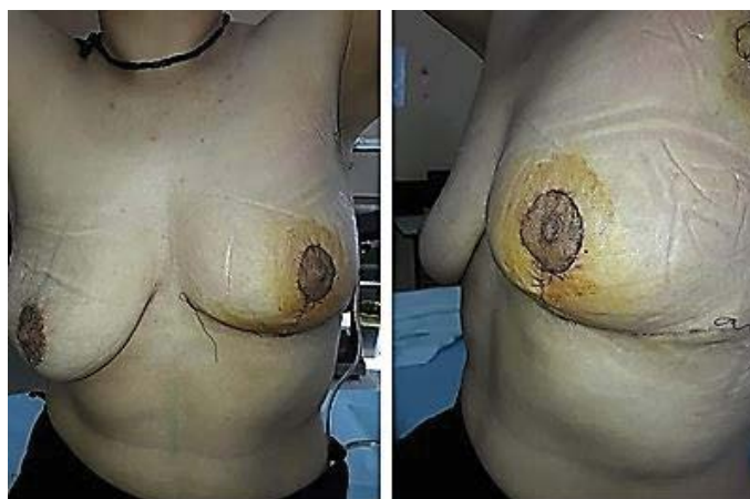
Figure 6. 12 days after surgery.

According to morphological examination (#3988) no tumor lesions were revealed along the resection margins of removed tissues. In the damaged part removed from the left breast, multifocality was noted - 3 different tumor nodes (11 mm, 8 mm, 10 mm in size), identified as invasive ductal carcinomas, were revealed. The degree of differentiation was GII - with in situ component, in which the differentiation rate GII, also was revealed. It should be noted that lymphangiogenesis was observed, but perineural invasion was not seen. No metastatic lesions were found in any of the studied 19 lymph nodes. According to the results of immunohistochemical study, the disease proved to be hormone-sensitive (ER + , PR, Her2/neu1 + ), Ki 67.5%.