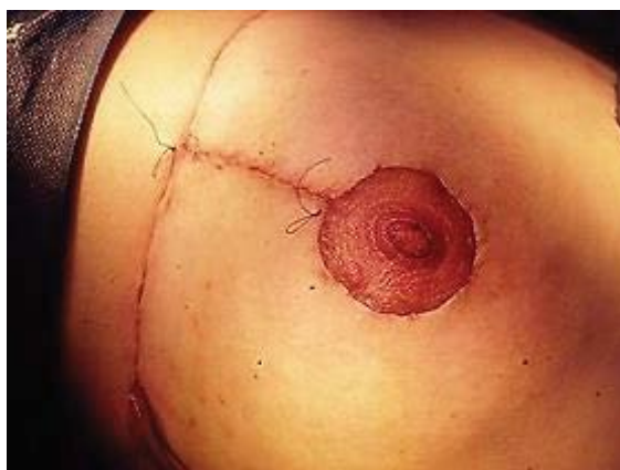
Figure 5. Operated breast after remodelling and closure.

Breast remodelling was performed using situational and sub dermal stitches so that the resulted scar replicated the shape of an inverted "T" ( Figure 5 ). Additional incision made in the axillary fossa, facilitated approach to the lymphatic collectors of I-II-III levels which were removed end block. The axillary fossa was drained, the wound were treated with antiseptic solutions and sutured by using subcuticular, continuous stitches ( Figure 6 ).