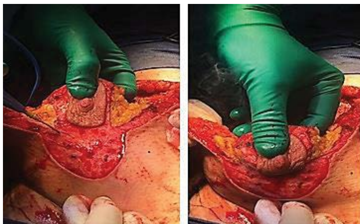
Figure 4. Nipple - areola complex (NAC) mobilization.

Breast remodelling was performed using situational and sub dermal stitches so that the resulted scar replicated the shape of an inverted "T" ( Figure 5 ). Additional incision made in the axillary fossa, facilitated approach to the lymphatic collectors of I-II-III levels which were removed end block. The axillary fossa was drained, the wound were treated with antiseptic solutions and sutured by using subcuticular, continuous stitches ( Figure 6 ).