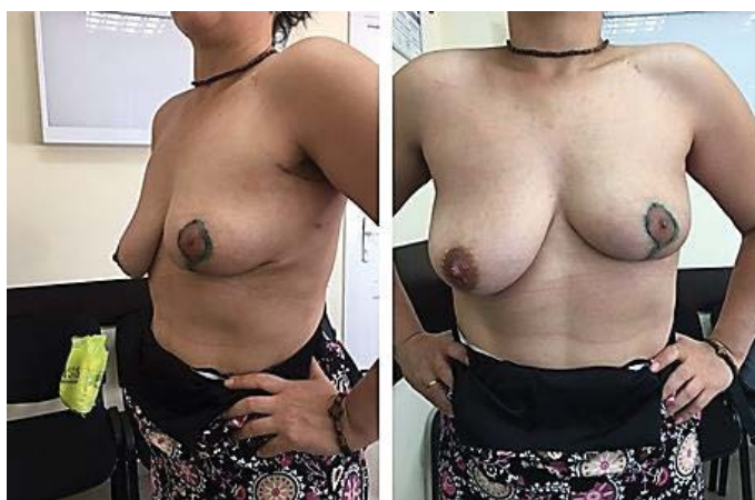
Figure 7. A month after surgery.

Breast conserving surgery was performed in full compliance with oncoplastic principles of surgical oncology. All malignant lesions within the one quadrant have been removed. Have been achieved negative resection margins - which is the main task of these types of operations. During the surgery, axillary lymph nodes of I-II-III levels were removed through the additional incision. A satisfactory cosmetic outcome achieved by the oncoplastic surgery stipulates high or excellent ratings of patient satisfaction. A noticeable shape difference between mammary glands ( Figure 7 ) observed in the postoperative period might become more visible after the adjuvant radiation therapy due to radiation epitheliitis and fibrosis, which is why one-moment symmetrizing surgery is always avoided and is performed only in 6-12 months after the first surgical intervention ( Figure 7 ).